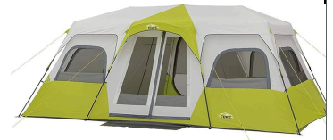
NO: Example of unsuitable tent.

Waterproof tent-sized ground sheets or "footprints" to go between the tent floor and the grass/dirt field, as appropriate for your style of tents