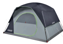
YES: Example of suitable tent.

DUE TO FACILITY POLICY, NO TENT PEGS/STAKES MAY BE USED. PLEASE BRING TENTS THAT CAN REMAIN UPRIGHT WITHOUT REQUIRING STAKING INTO THE GROUND. No plastic, metal, or other pegs may be used - nothing may be inserted or hammered into the grass and your tent structure must stay upright without them. Please examine your tents before the event to ensure they will be suitable without pegs/stakes.